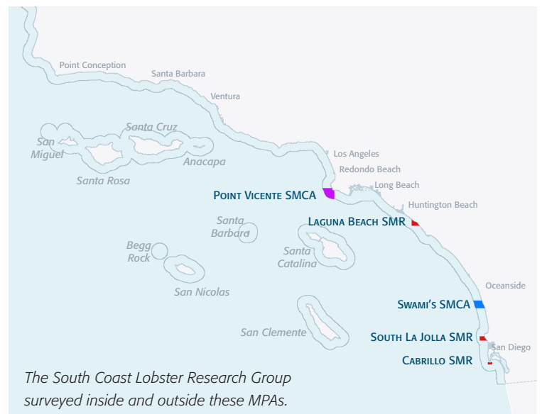
The South Coast Lobster Research Group surveyed inside and outside these MPAs.

California spiny lobsters ("spiny lobsters") are key members of marine ecosystems in the South Coast, serving critical ecological roles and supporting important commercial and recreational fisheries. These large, nocturnal invertebrates shelter in rocky crevices during the day and come out at night to hunt in kelp forests, rocky intertidal zones, seagrass beds, estuaries, and soft-bottom subtidal ecosystems. Spiny lobsters eat sea urchins and other benthic invertebrates, and are in turn eaten by large fishes and marine mammals.